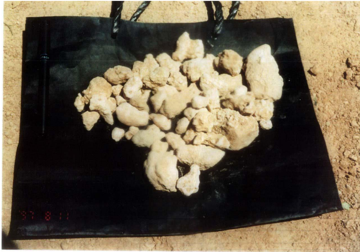
The lime stones