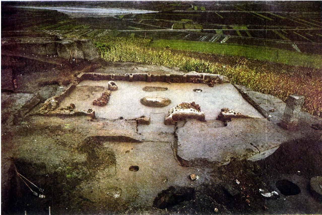
The floor (10x20m)