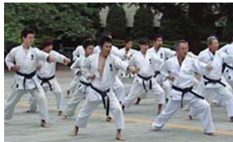
Karate club at Tokyo Tech